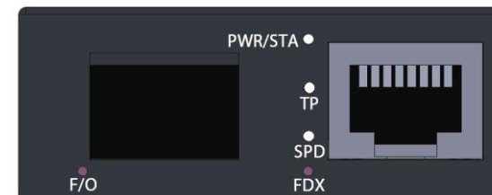
Figure 2. MCT-3612 WDM & SFP Front Panel