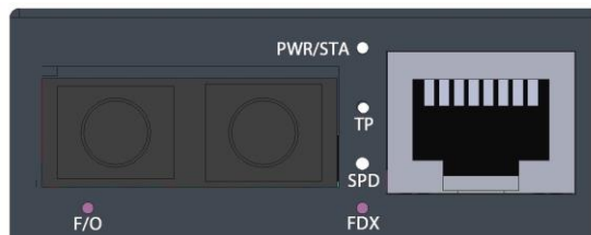
Figure 1. MCT-3612 Dual Fiber Front Panel