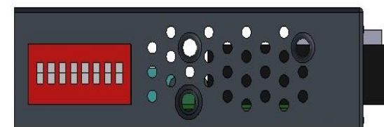
Figure 4. MCT-3612 Converter Side Panel