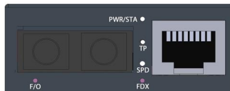
Fig. 1 Dual Fiber Front Panel of MCT-3002 Converter