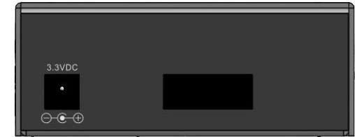
Fig. 3 Rear Panel of MCT-3002 Converter