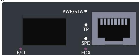
Fig. 2 WDM & SFP Front Panel of MCT-3002 Converter